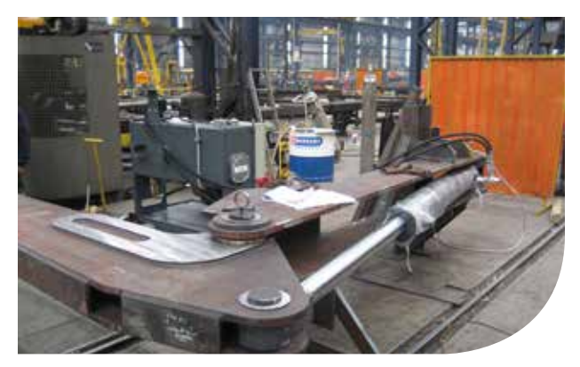
Actuator arm prior to installation