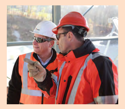
Our committed and highly competent people make the difference to our customers