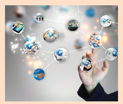
We have deep knowledge about our custmers' business environment, processes and challenges